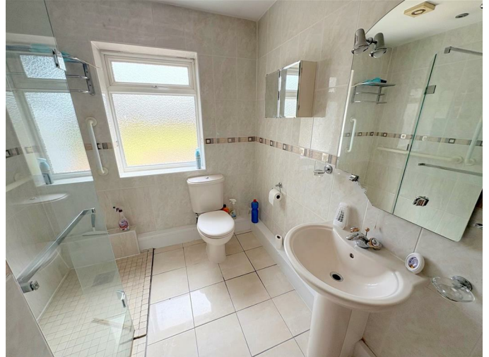
Shower Room 9'9" x 6'11" (2.99 x 2.13)

Skimmed ceiling with spotlights, tiled walls, tiled flooring, chrome heated towel rail, three piece suite comprising a wet room style shower with dual shower head, pedestal wash hand basin and a low level W.C., storage cupboard, uPVC double glazed window with obscured glass to the rear.