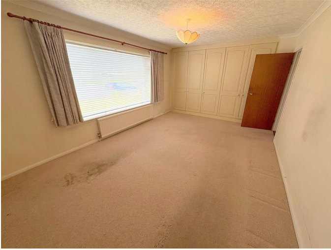
Bedroom One 16'5" x 11'5" (5.02 x 3.48)

Papered and coved ceiling, skimmed walls, fitted carpet, radiator, fitted wardrobes, uPVC double glazed window to the front.