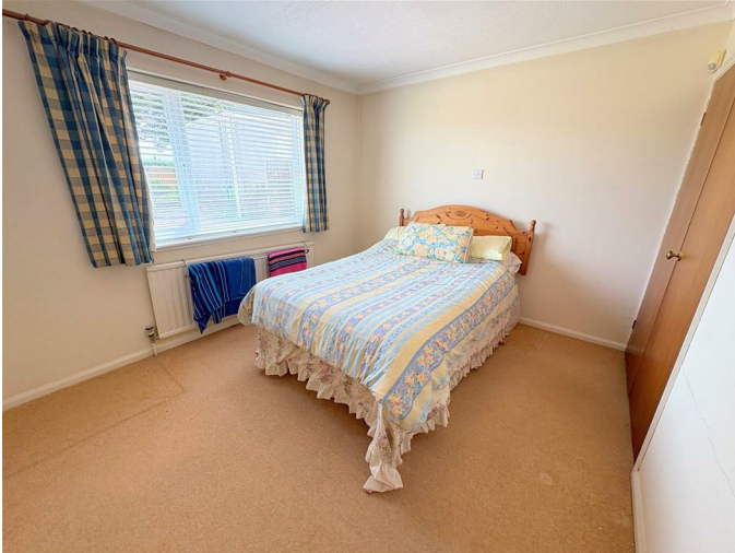
Bedroom Two 12'1" x 9'10" (3.70 x 3.02)

Papered and coved ceiling, skimmed walls, fitted carpet, radiator, storage cupboard housing the gas combination boiler, uPVC double glazed window to the rear.