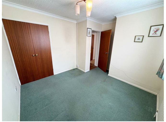
Bedroom Three 11'5" x 10'1" (3.48 x 3.09)

Papered and coved ceiling, skimmed walls, fitted carpet, radiator, built-in storage cupboard / wardrobe space, uPVC double glazed window to the side.